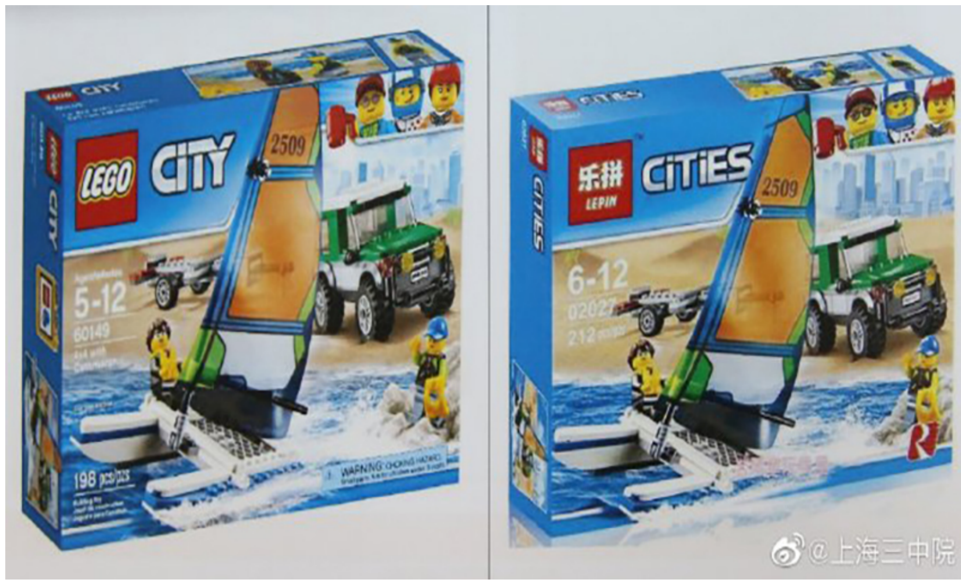
The strangely similar packaging of a Lego set (left) and Lepin set.

Nine people in Shanghai were sentenced up to six years in prison on Wednesday for infringing on the copyright of Danish toymaker LEGO, as China looks to take strict measures to protect intellectual property. The business' illegal turnover amounted to 330 million yuan ($48.31 million), Shanghai No.3 Intermediate People's Court said in their verdict.